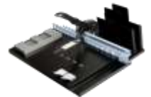
BooXTer Zero Max