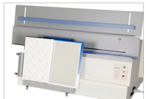
BooXTer Trio™ can be expanded with the optional Fastbind Cover Setter™