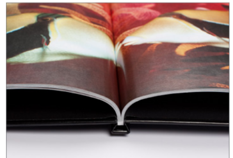
Strong, square and clean bind.