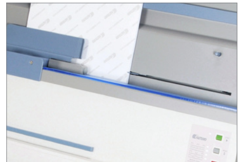
Recognizes the sheet format automatically and places staples based on the selected program.