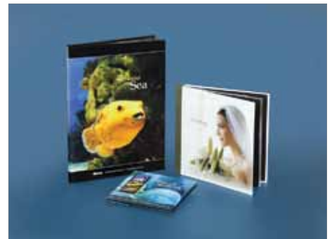
Professional customized hard covers and cases