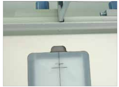
Registration marks for thicker and thinner materials