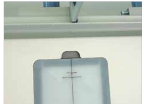
Registration marks for thicker and thinner materials offer you more versatility in applications.