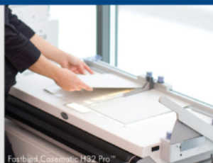
Fastbind Casematic H32 Pro™

Once the cover is made, you can finish the book using a Fastbind Binding machine. Fastbind provides all the necessary materials and supplies to produce hard covers for the print-on-demand environment.