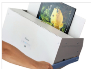
Easy to use.