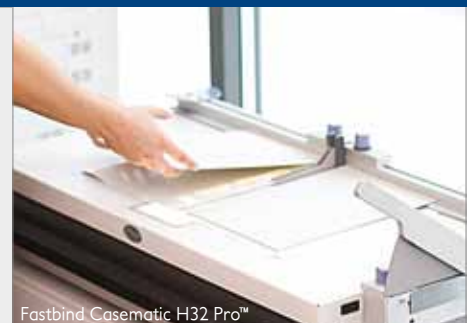
Fastbind Casematic H32 Pro™

For the best quality personalized hard covers, we recommend the Fastbind Casemakers. For example, Fastbind Casematic H32 allows you to create the cover of your choice, in all the formats compatible with the FotoMount F32. Just imagine and design the cover for your album. Producing it will be a matter of minutes. In addition, Fastbind FotoMount F32 comes with a cover guide and two cover positioning holders to make the final mounting easier!