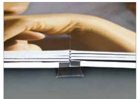
The finished book opens astonishing 180 degrees.