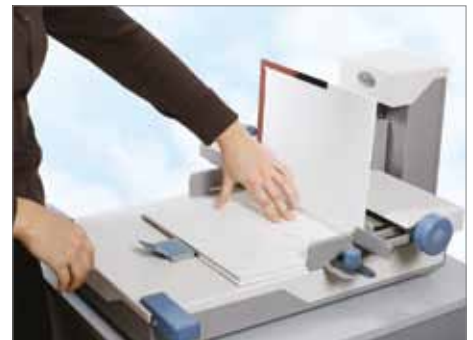
A Cover Guide and two Cover Positioning Holders are included.

The Fastbind FotoMount™ product line provides all the consumables needed to mount a PhotoBook. With only two types of supplies, you can manage all album sizes (up to 310 x 316 mm and 80 mm thick): Fastbind PhotoBook Mounting Sheets™ form the core of the book block and Fastbind PhotoBook End Sheets™ attach your book block to the cover.