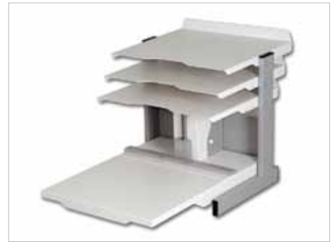
Fastbind FotoMount F46e is a compact, tabletop unit.