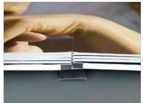
The finished book opens astonishing 180 degrees.