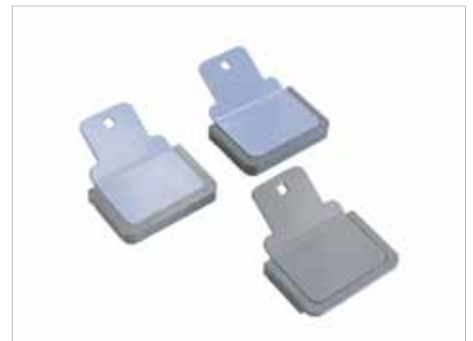
A Cover Guide and two Cover Positioning Holders are included.