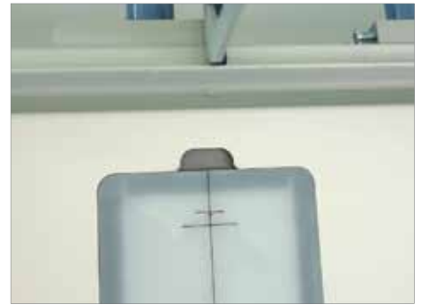
Registration marks for thicker and thinner materials offer you more versatility in applications.