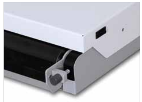
The integrated edge folding unit is adjustable for different cover board thicknesses.