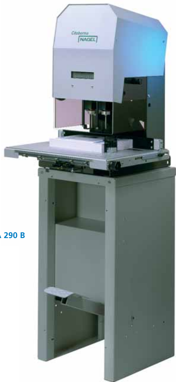
NAGEL CITOBORMA 290 B with treadle.