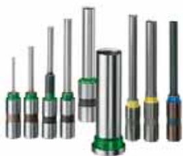
Nagel paper drill bits: 2–35 mm diameter, 50–60 mm working length, and special designs.

The special cardboard drilling pads by NAGEL ensure that even the last sheet of the pile is perforated cleanly; they also reduce wear on the plastic support bar.