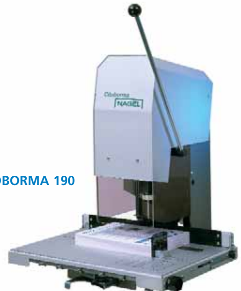
NAGEL CITOBORMA 190 table top.