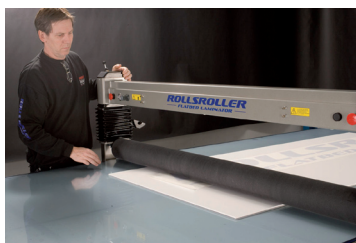
Ergonomic working height.