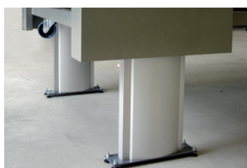
Even better ergonomics if you choose a height-adjustable ROLLROLLER®.