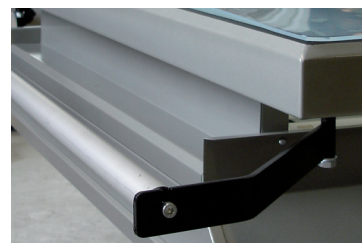
Media holder for end of bed is a practical option.