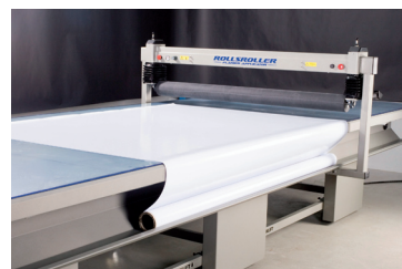
Practical side pockets for textile media.