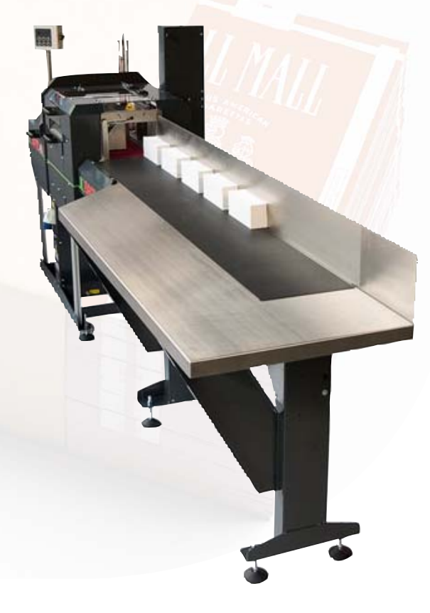
TRL24-30 with label in-feed conveyor

Machines in the TR-Label Bandall Series are available in a wide range of channel sizes suitable for 28, 48, 75 and 100 mm bands.