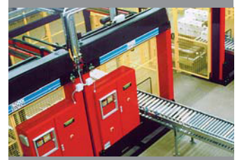
Altmark Käserei, Germany