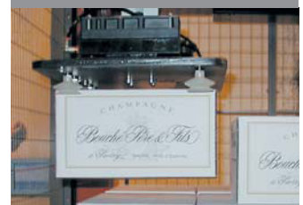
Bouché Père & Fils, France