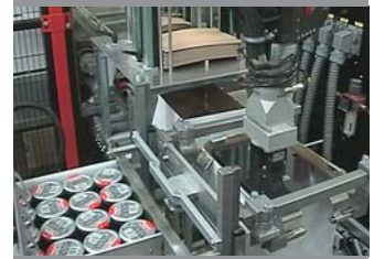
Sig. Ágústsson, Iceland