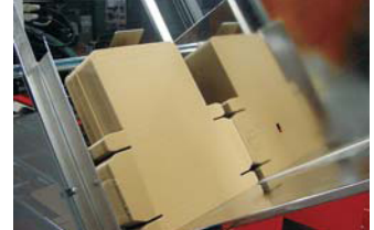
Geberit AG, Switzerland

Head office: SOCO SYSTEM A/S Helgeshoej Allé 16D DK-2630 Taastrup Denmark Tel +45 43 52 55 66 Fax +45 43 52 81 16 info@socosystem.com www.socosystem.com