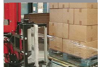
United Milk, England