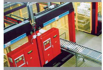
Altmark Käserei, Germany