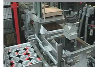
Sig. Ágústsson, Iceland