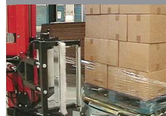
United Milk, England