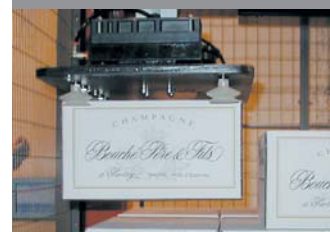
Bouché Père & Fils, France