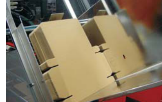
Geberit AG, Switzerland

Head office: SOCO SYSTEM A/S Helgeshoej Allé 16D DK-2630 Taastrup Denmark Tel +45 43 52 55 66 Fax +45 43 52 81 16 info@socosystem.com www.socosystem.com