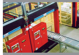
Altmark Käserei, Germany