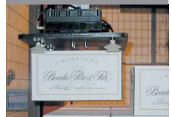
Bouché Père & Fils, France