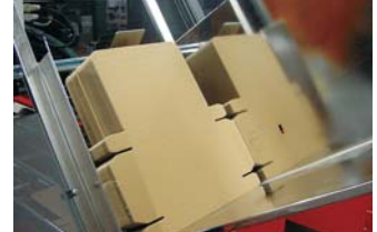
Geberit AG, Switzerland

Head office: SOCO SYSTEM A/S Helgeshoej Allé 16D DK-2630 Taastrup Denmark Tel +45 43 52 55 66 Fax +45 43 52 81 16 info@socosystem.com www.socosystem.com