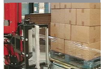
United Milk, England