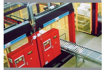
Altmark Käserei, Germany