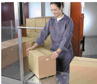
The ball table facilitates transfer to the stripper plate (accessory).