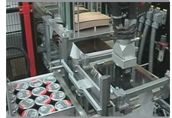
Sig. Ágústsson, Iceland