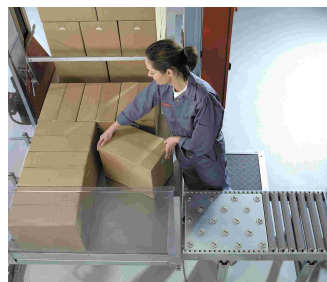
On the stripper plate, the operator forms the desired pattern.