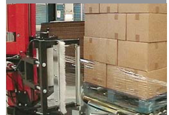
United Milk, England