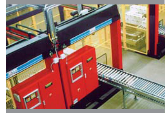
Altmark Käserei, Germany