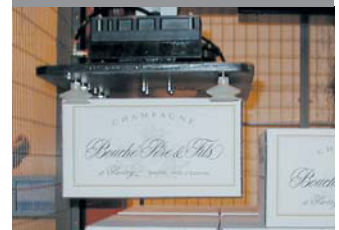
Bouché Père & Fils, France