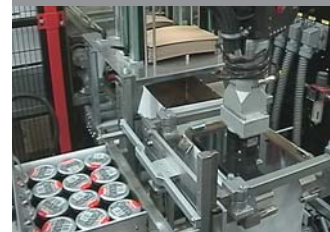
Sig. Ágústsson, Iceland