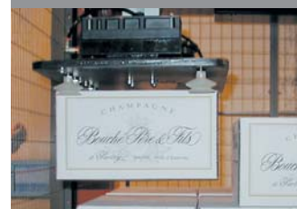
Bouché Père & Fils, France