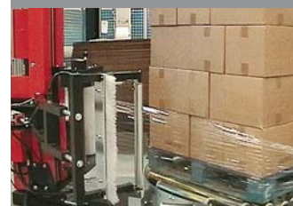
United Milk, England