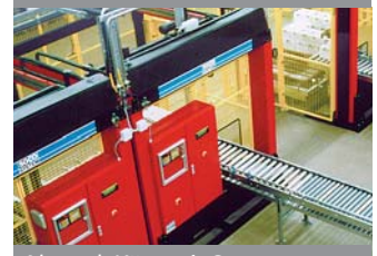
Altmark Käserei, Germany