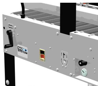
Crank handle adjustment for case size