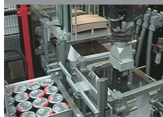
Sig. Ágústsson, Iceland