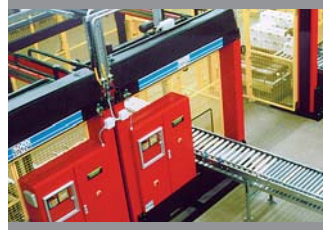
Altmark Käserei, Germany