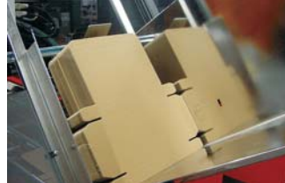
Geberit AG, Switzerland

Head office: SOCO SYSTEM A/S Helgeshoej Allé 16D DK-2630 Taastrup Denmark Tel +45 43 52 55 66 Fax +45 43 52 81 16 info@socosystem.com www.socosystem.com