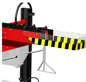
Automatic flap folding.