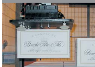
Bouché Père & Fils, France