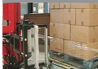
United Milk, England