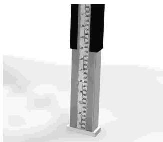
Tape measure on the legs of the machine for easy and precise working height adjustment.