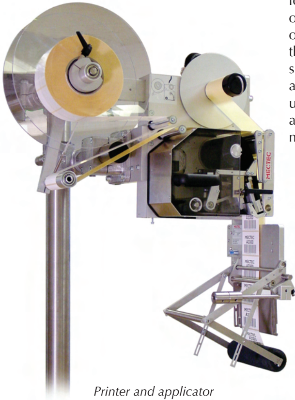
Printer and applicator in right hand version

The TFQ100 is perfect for front batch labelling of boxes etc that are of the same size and that moves in the same speed. It has the reliable, robust and easy to use design - as seen on all the Mectec family machines!