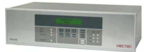
Printer Control Unit PCU III (Please note: ACC not included)