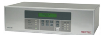
Printer Control Unit PCU III